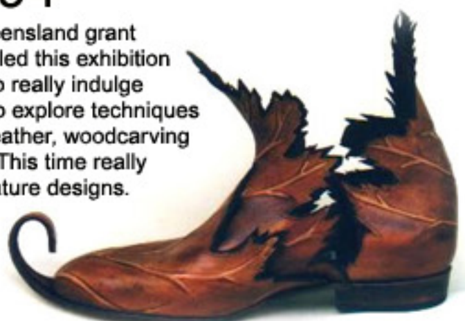
Prince of Autumn Leaves (acquired by Powerhouse Museum Sydney in 1997)

Way back in 1994 we received an Arts Queensland grant to produce a series of shoe art pieces. We called this exhibition Metamorphosis and it was our first chance to really indulge our whims in a non-commercial way. We began to explore techniques like embossing, hand-painting and moulding of leather, woodcarving and the use of exotic leathers and feathers. This time really paved the way for many of our future signature designs.