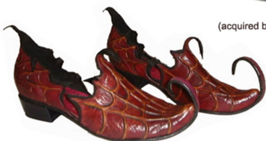
Redback Spider shoes